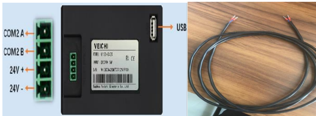
Touch Screen Serial Interface Definition